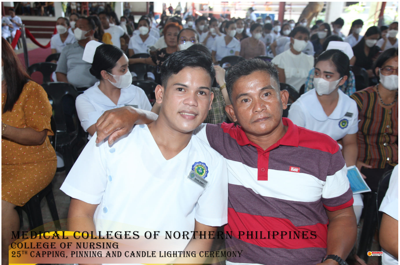
MEDICAL COLLEGES OF NORTHERN PHILIPPINES COLLEGE OF NURSING 25 TH CAPPING, PINNING AND CANDLE LIGHTING CEREMONY

Tertiary Education Subsidy Scholar BS Nursing Batch 2023